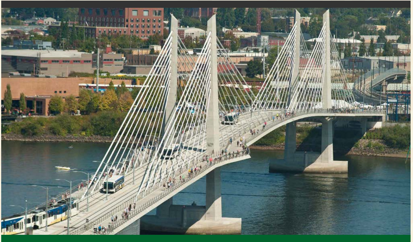
Tilikum Crossing - Bridge of the People Tilikum is Chinuk Wawa (word) for “people” or “family”